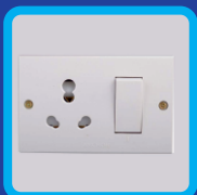
Power Source for Refilling Bowser Pump