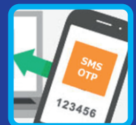
OTP Based Refill System