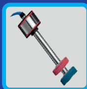
Level Cum Temperature sensor