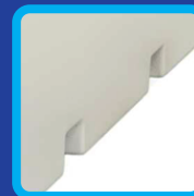
Opening for forklift