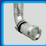
2" dry brake coupling for cistern filling