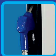
Nozzle with automatic shut off & automatic nozzle holder