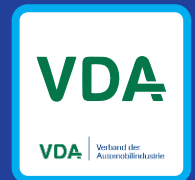
VDA Approved Product