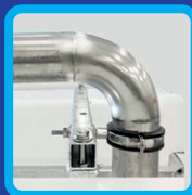
Stainless steel construction & piping