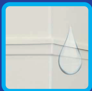
3 Layered Tank